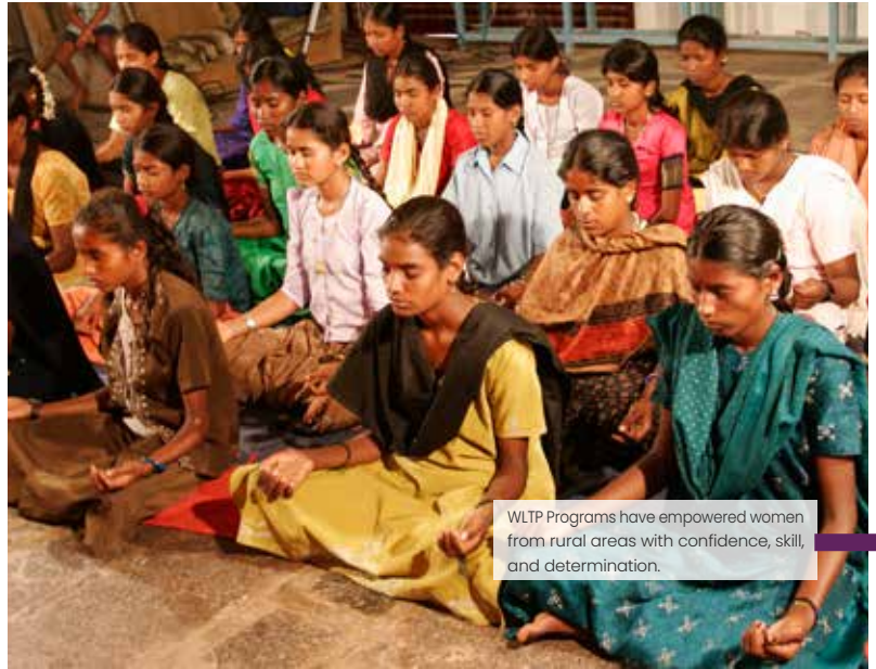
WYLTP Programs have empowered women from rural areas with confidence, skill, and determination.

Through WYLTP, these empowered women are not only gaining confidence & resilience but also igniting positive change & driving sustainable development in their respective regions.