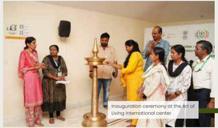
Inauguration ceremony at the Art of Living International center

To further amplify this impact, 140 Cluster Coordinators will receive specialised training to expand the adoption of agroecological practices through Women's Self-Help Groups (SHGs). The Art of Living Social Projects' holistic approach enhances this initiative by incorporating Sudarshan Kriya, a powerful breathing technique known for its benefits in stress management and emotional resilience. This unique combination of practical farming knowledge and emotional well-being ensures that the Krishi Sakhis are not only skilled in sustainable agriculture but also geared to lead, mentor, and inspire others in their communities.