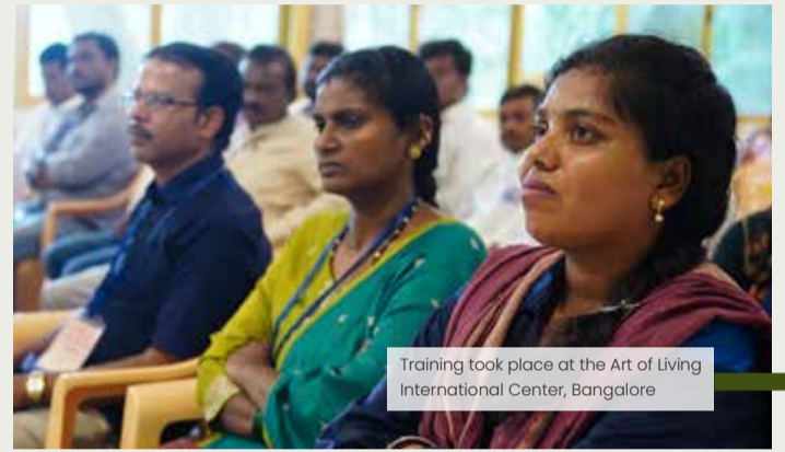
Training took place at the Art of Living International Center, Bangalore

The first batch of 40 Cluster Coordinators recently completed an intensive training session at The Art of Living International Center in Bengaluru. The organisation, renowned for its sustainability and climate action initiatives, provided these coordinators with the tools, knowledge, and inspiration needed to promote natural farming in rural areas. Equipped with essential skills and inspired to lead change, these supervisors are now ready to promote climate-resilient farming practices across the region. Collaborating closely with an empowering network of Krishi Sakhis, they are set to ignite a self-sustaining agricultural revolution contributing to rural resurgence.