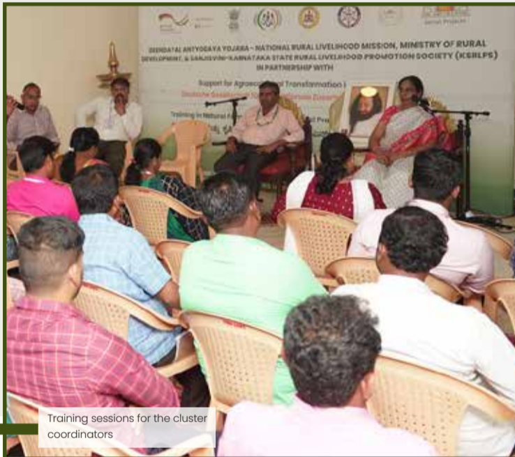
Training sessions for the cluster coordinators